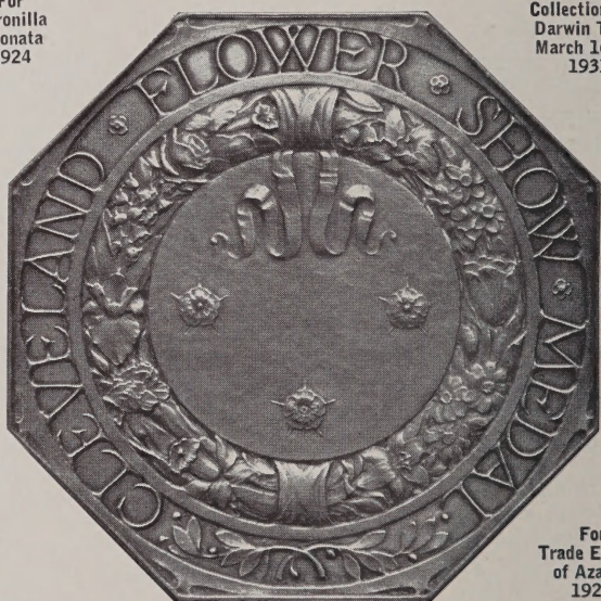
For Trade Exhibit of Azaleas 1925